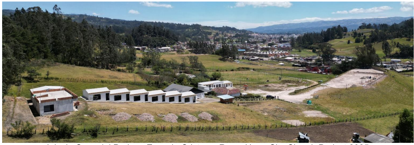
Iglesia Casa del Padre y Escuela Cristo es Rey – Hope City Church Project 2025